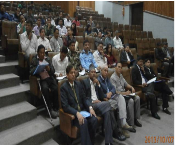
Five thematic papers were presented in the technical session, which is briefly summarized below: